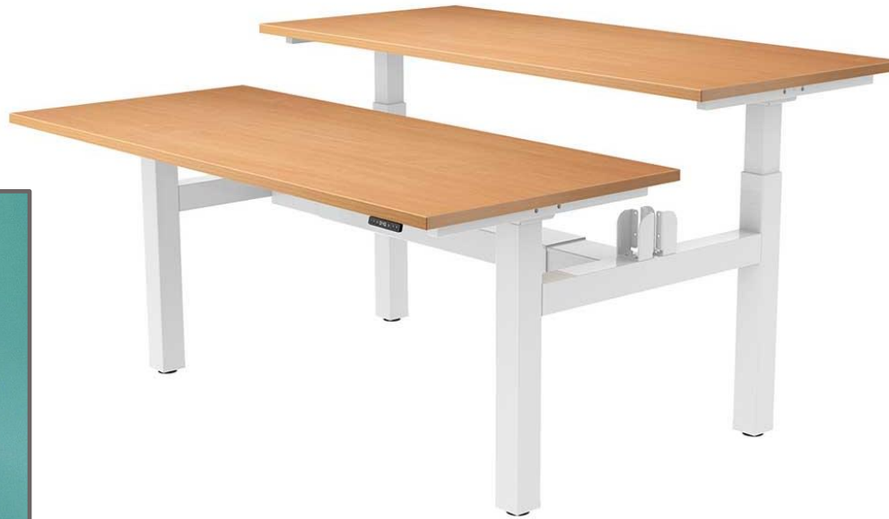
Duo Sit-Stand Desk