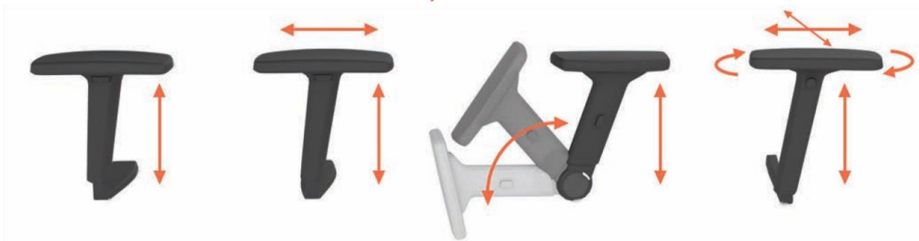
Height Adjustable Arms (AA1D)