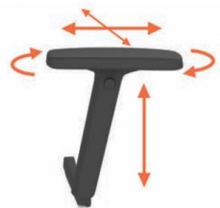
Multi-Functional Adjustable Arms (AMF)