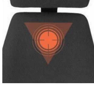
6. Performance Seat

Increases the contact area of the upper spine by filling the space between the shoulder blades, helping to prevent slouching and reduce pain/discomfort in the shoulder and neck area.